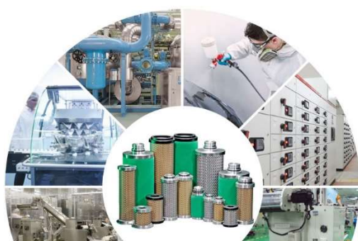
FOCUS ON THE DEVELOPMENT AND MANUFACTURE OF INDUSTRIAL COMPRESSED AIR PURIFICATION EQUIPMENT